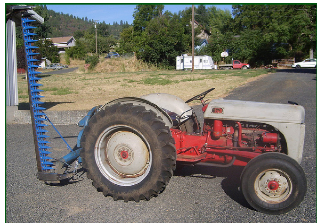
Figure 2. Sickle-bar type cutter.

The first step in hay production is the actual cutting of the hay. Hay mowers fall mainly into two classes — sickle-bar cutters (Fig. 2) and disk mowers (Fig. 3). Sickle-bar mowers have long cutting heads with reciprocating teeth. Disk mowers have cutting heads with several small rotating cutters. In the past, it was difficult to adjust cutting height and most mowers left a stubble height of 2 inches or less. Cutters today are more adjustable and a higher cut leaves some leaf material to support photosynthesis and encourages a more rapid recovery from the harvest.