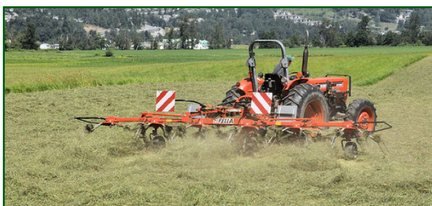
Figure 6. Tedder used for inverting dried forage to speed drying.