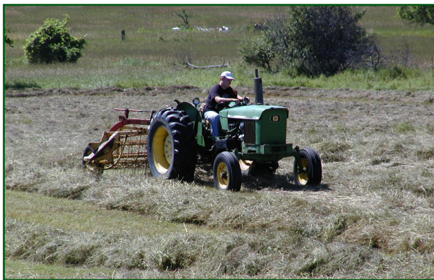
Figure 4. Dried forage being raked into windrows.

After cutting, the hay should remain in the field to dry or “field cure.” The dried or cured forage is then raked (Figs. 4 and 5) into windrows that are the width of the take-up header of the baler. Sometimes a heavy dew, high relative humidity, or rain will cause the windrow to be dry on top but wet underneath. When this happens you can use an implement called a tedder to turn the windrow over to help it dry (Fig. 6). Once the moisture content in the windrow has reached the appropriate level, the forage can be baled into round or square bales.