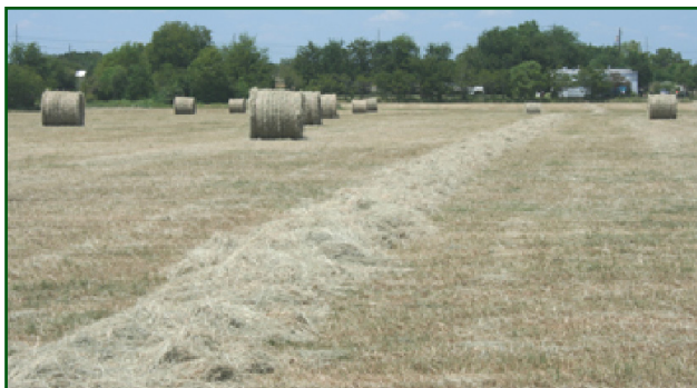
Figure 5. Dried forage after being raked into a windrow.