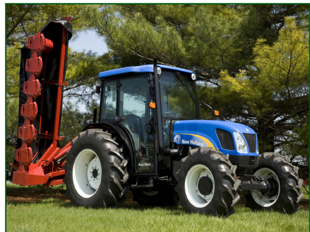
Figure 3. Disk mower cutter.